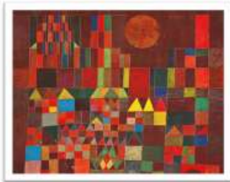
Castle and Sun

He was influenced by movements such as cubism, surrealism and expressionism but also appreciated the simplicity of children's art (shown in the examples below).