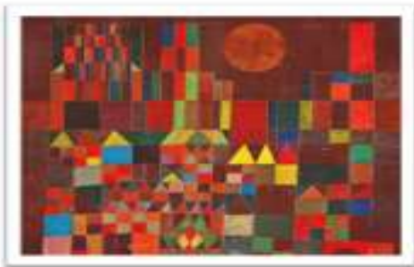
Castle and Sun

He was influenced by movements such as cubism, surrealism and expressionism but also appreciated the simplicity of children's art (shown in the examples below).